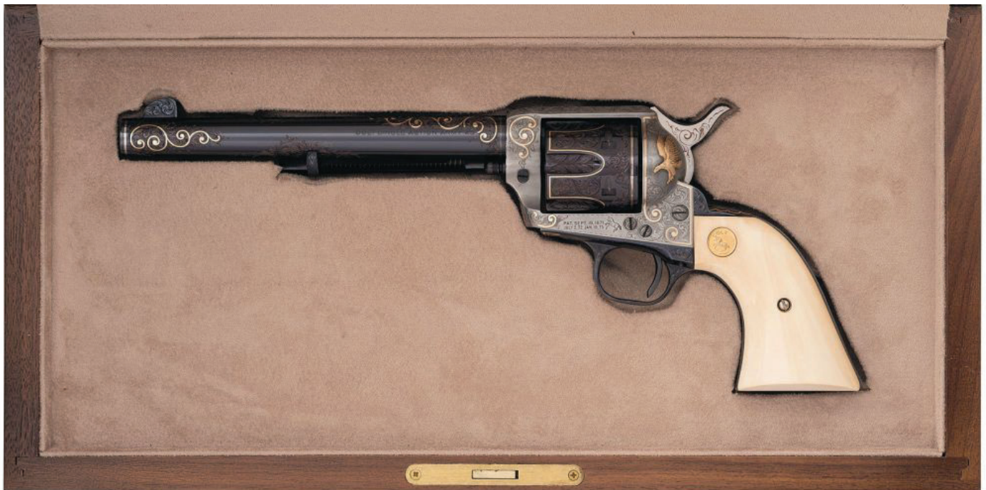
Lot 491: Alvin White Signed, Master Engraved, and Precious Metal Inlaid Colt Second Generation Single Action Army Revolver with Case

The first revolver offered in this auction is a 2nd Generation Single Action Army made in 1957 and chambered in .45 Long Colt. The gun features 75% plus coverage, which consists of intricately executed English/American style floral scroll engraving incorporating vines and borders of gold inlay. Silver inlaid bands at the muzzle and breech are accompanied by a high relief gold eagle flying on the recoil shield. The cylinder flutes are also outlined with a beautiful inlaid band that is uninterrupted around the entire cylinder. White's signature is located under the right grip. Rounding out the offering is a finely figured locking hardwood case with a double lid, one solid and one glass.